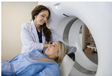
Tests and Investigation